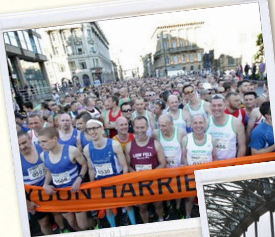
Blaydon Race 9th June 2022