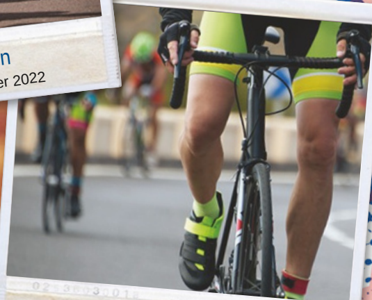
Kielder Run Bike Run