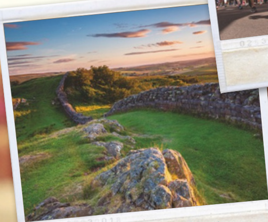
Hadrians Wall Challenge